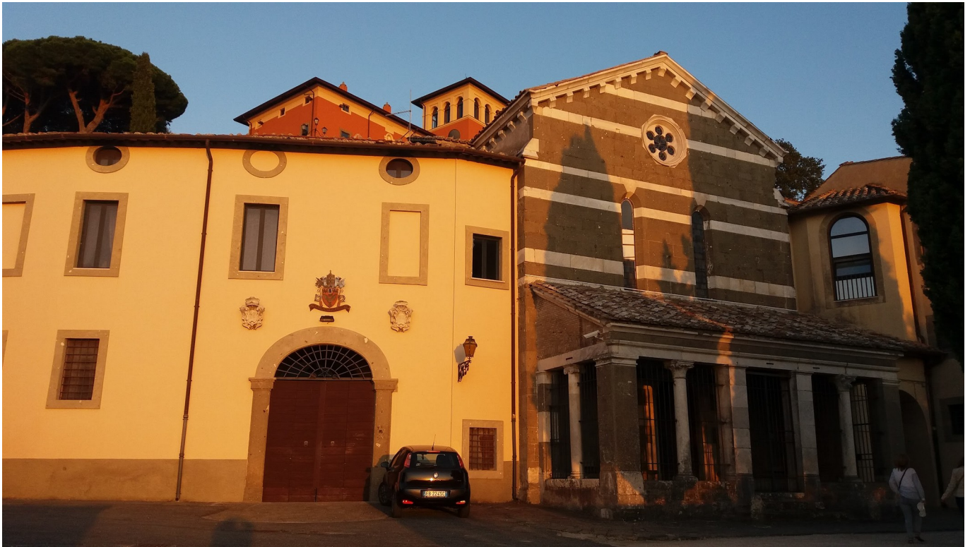
Photo of Villa Palazzola

We stayed at Villa Palazzola, owned by the English College –a beautiful residence with superb views of the adjoined large volcanic lake. We attended Mass every day and ate meals at the residence. The recently ordained curate of Brentwood cathedral was the primary priest overseeing our group. There were lounge areas at the residence, and a bar too, where pilgrims could informally socialise. We also met with fellow pilgrims separate to our diocesan group, in a convivial atmosphere.