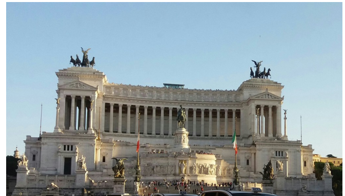
Photo of landmark building in Rome, nicknamed the 'Wedding Cake' by Americans