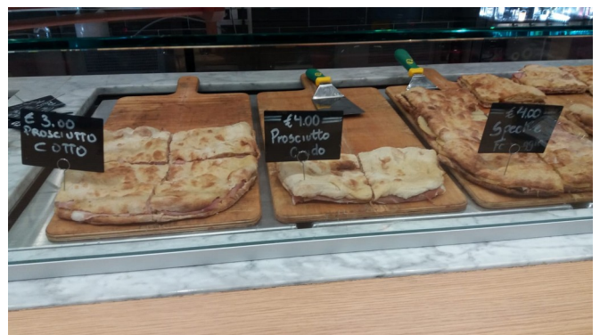
Photo of some traditional Italian food