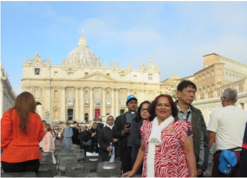
Photo of pilgrim at canonisation ceremony

Some of us have the books that were distributed at the ceremony, which gave the Latin and English versions of the Mass. St. John Henry Newman was honoured in music at the ceremony, when his hymn "Lead Kindly Light" was played.