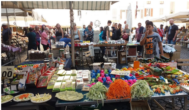
Photo of Italian marketplace