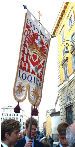
"Cor ad Cor Loquitor" standard propped-up by pupils of the Oratory school near Reading in Oxfordshire.

St. John Henry Newman was born in 1801 in Oxford, and baptised in the Church of England. He studied Christian theology and on 9th October 1845 was received into the Catholic Church, at Littlemore (outside Oxford) by Blessed Dominic Barberi. In 1847, he was ordained a Catholic priest. The Pope gave him the mission of forming oratories of St. Philip Neri in Birmingham and London. His first Catholic home was on the site which is now called the Maryvale Institute, and the name Maryvale is the name of St. Philip Neri's church in Rome. The oratories are small, stable communities of priests living together in charity, dedicated to prayer, to the liturgy, preaching, teaching and the intellectual life.