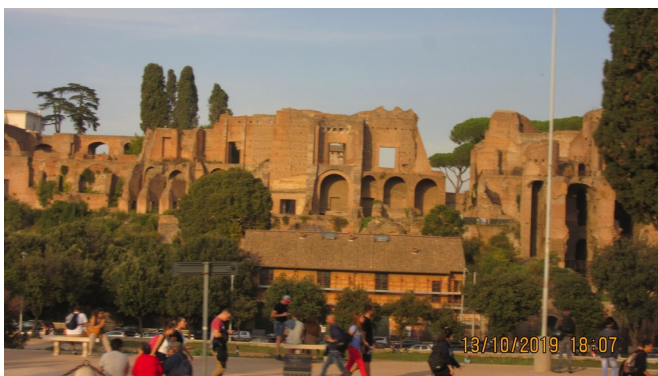
Photo of ancient roman ruins at Palatine Hill in Rome