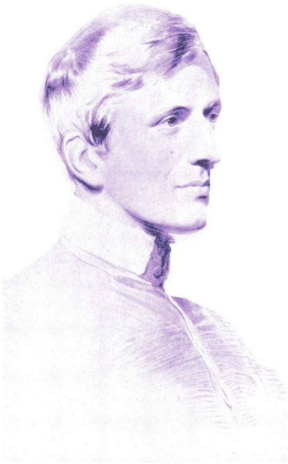
Portrait of John Henry Newman by George Richmond (1844)