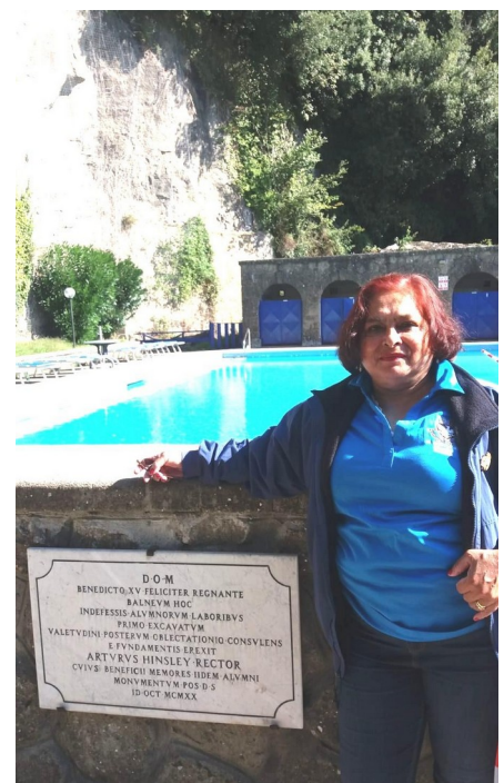
Photo of pool in Villa Palazzola