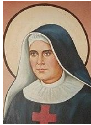
Picture of St. Giuseppina Vannini; cropped Wikimedia image in public domain.