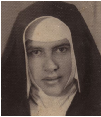
Photo of St. Dulce Lopes Pontes; Wikimedia image in public domain.