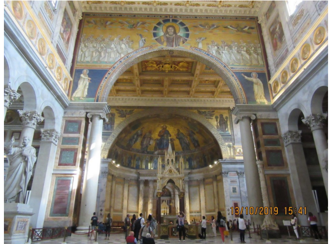
Photo of Basilica of St. Paul "Outside the Walls"