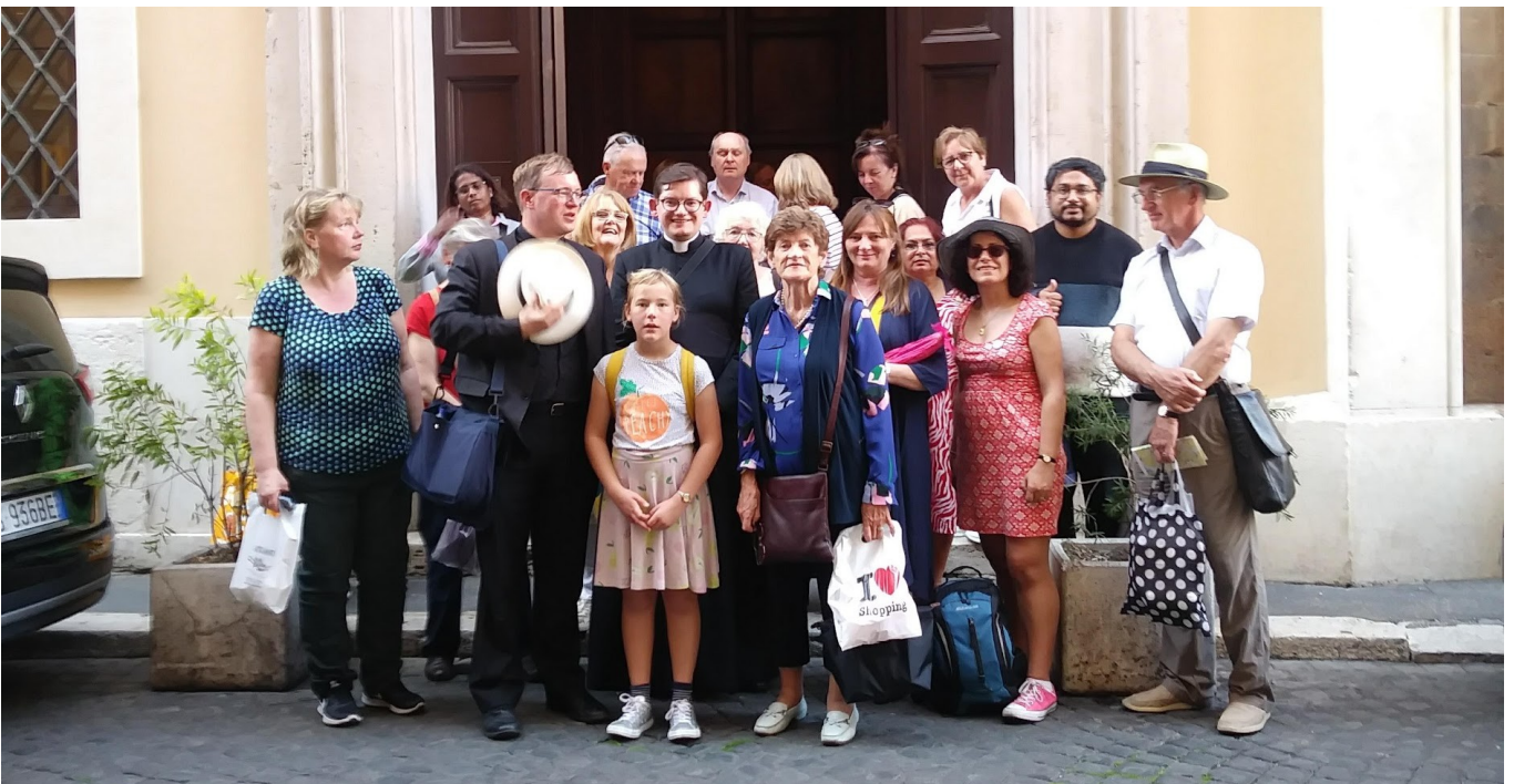
Photo of Brentwood diocese pilgrimage group

Some of us have the books that were distributed at the ceremony, which gave the Latin and English versions of the Mass. St. John Henry Newman was honoured in music at the ceremony, when his hymn "Lead Kindly Light" was played.