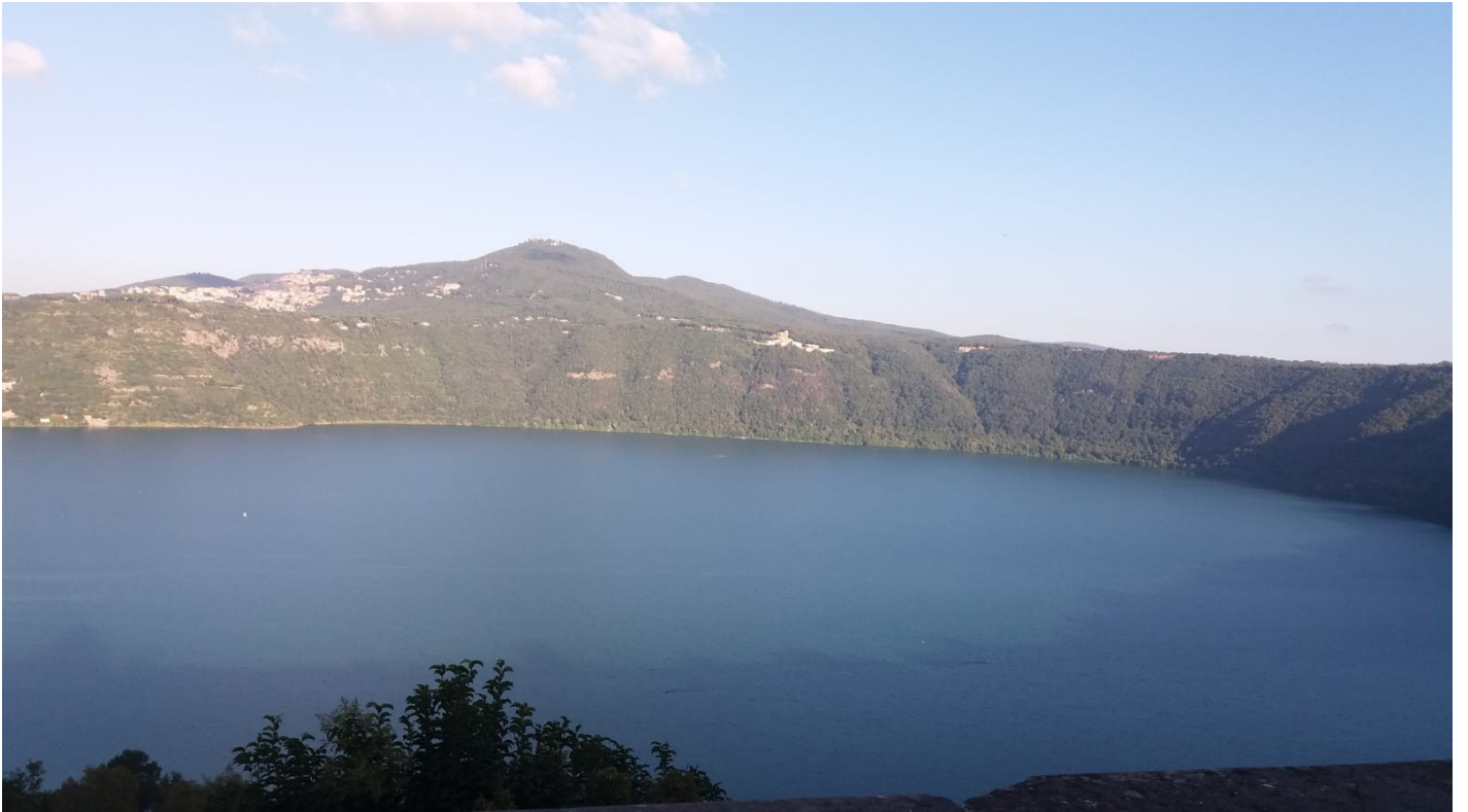
Photo of volcanic lake adjoining our residences