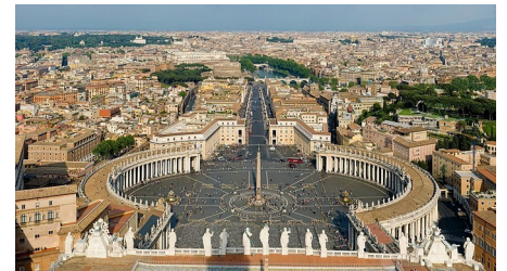
Photo of St. Peter's square in Vatican City 1

The canonisation of Cardinal Newman might become the conclusion of the official recognition of Newman's sanctity by the Catholic Church, which happened nine years after the beatification, on 13th October 2019 at the Vatican (which is geographically encircled by Italy's capital of Rome). As with his beatification, the Brentwood diocese sent out a group of pilgrims on a diocesan trip to attend the canonisation. Likewise, on this trip, there were again pilgrims from the Most Holy Redeemer parish.