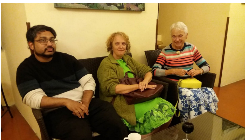
Photo of pilgrims relaxing socially at Villa Palazzola, taken by Jennifer Fernandes. Used with permission