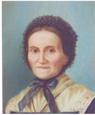
Picture of St. Margarita Bays Pontes; cropped Wikipedia image in public domain.